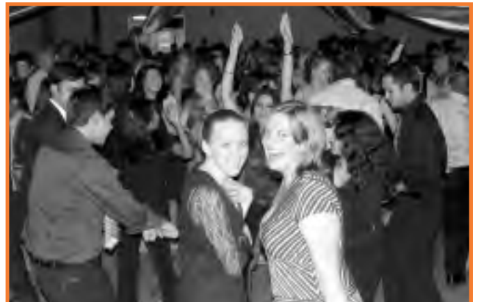
The Black Student Union hosted the 10th Annual Black Tie Affair Feb. 16 in the Alumni Memorial Union. Students, faculty and staff dressed for the red carpet and danced as long as the music played.