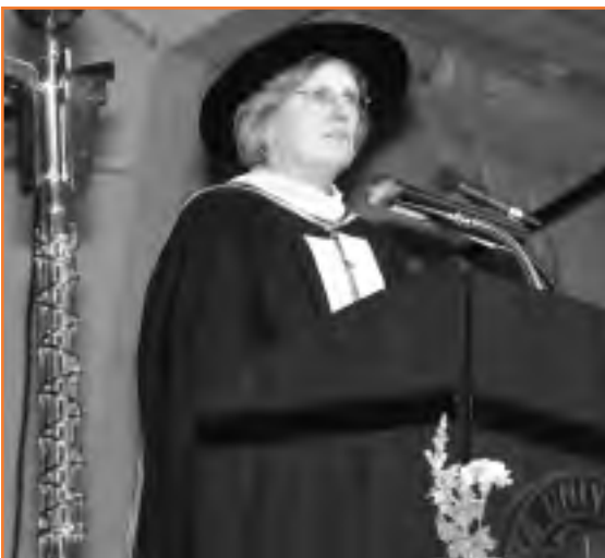
Kathryn Sullivan, Ph.D., the first American woman to walk in space, gave the commencement address. Currently the director of the Battelle Center for Math and Science Education Policy at The Ohio State University, she urged graduates to engage in authentic conversation as an essential tool for success.