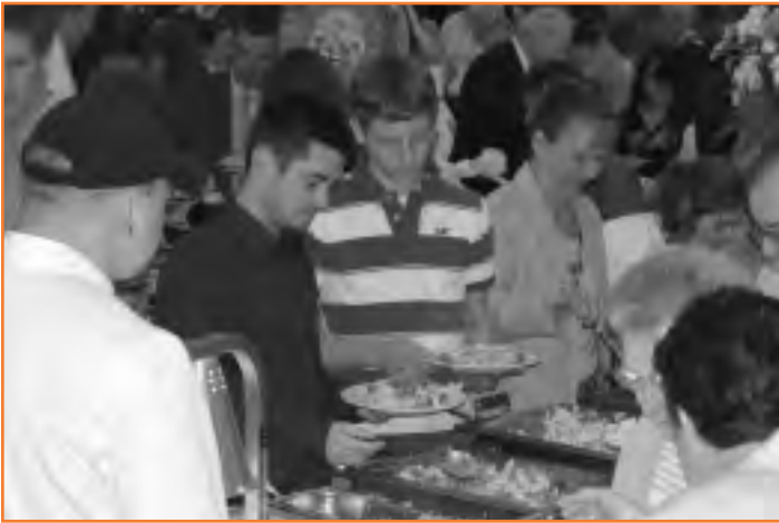
The Alumni Association sponsored a commencement brunch that served 875 people before the graduation ceremony.