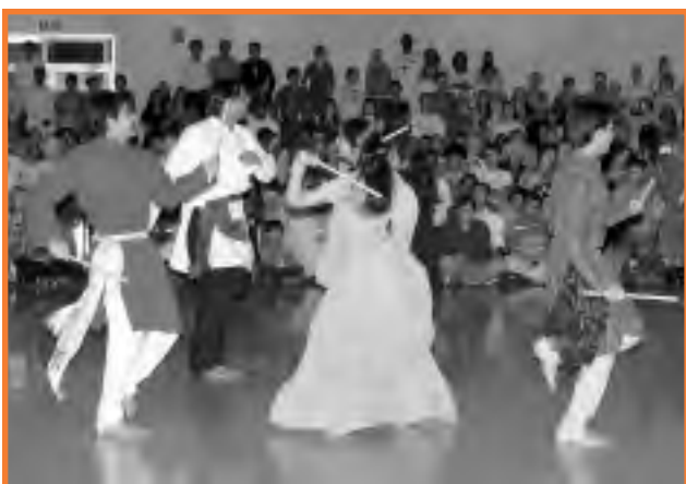
International students at The University of Findlay shared their cultures, customs and food at the 39th International Night April 20 in the AMU. Organized around the theme of "One People, One Race, One World," the evening featured international students from 15 countries who hosted booths and provided entertainment for the campus and community.

Organized by Campus Compact and the First-Year Experience program, students, faculty and staff completed 125 hours of service between April 14-20 in recognition of UF's 125th anniversary. Volunteers worked at the CHOPIN Hall mobile food pantry, participated in river clean-up, raised awareness of homelessness at Box City and sorted food at the Salvation Army, among other activities.