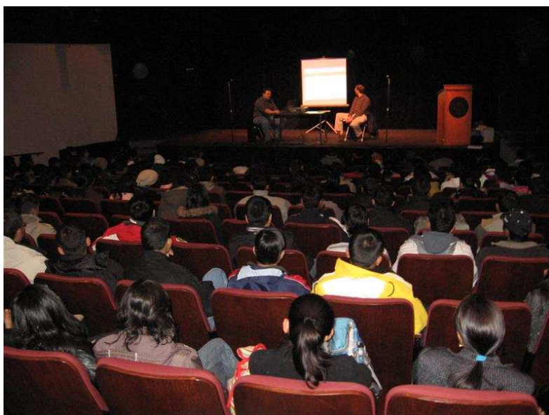
Students learn about Blackboard in the Spring 08 Orientation

Where ever you are in your college career, the new year always stands before us and asks us to reexamine our lives in light of the past year. As you think about this new year, what are the goals you want to achieve? What are the steps you need to take to reach them? What positive changes have you made in your life this past year that you want to see continue in the new? What are some of the shortcomings you have allowed in your life that you would like to improve? These are all important questions to think about seriously. Remember, your life is yours to make of it what you will. The decisions you make today will affect your future. We wish you all the best in 2008!