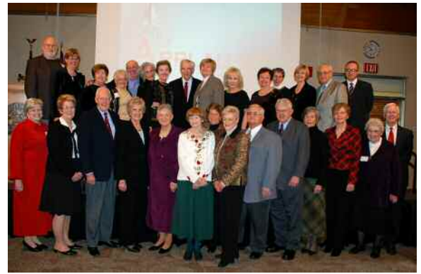
Volunteers with the Mazza Enthusiasts support organization for the Mazza Museum were honored as Distinguished Associates for their dedication.