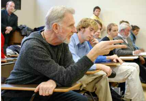
René Auberjonois was the Hennigs Chair guest actor on campus Dec. 7. He talked with students and coached them on acting techniques.

theatre students. Auberjonois won Broadway's 1970 Tony Award as Best Supporting or Featured Actor (Musical) for "Coco" with Katherine Hepburn. A native of New York City, Auberjonois' recent appearances include "The Patriot" starring Mel Gibson, "Sally Hemings: An American Scandal," "Frasier" and "The Practice." He also portrayed Paul Lewiston in "Boston Legal" for four years. Auberjonois portrayed Clayton Endicott III on the comedy series "Benson" and Odo for seven years on "Star Trek: Deep Space Nine." The Don and Barb Hennigs Chair for Theatre Guest Artists was started in 2003 to bring to campus national or international actors to share their expertise with UF the-