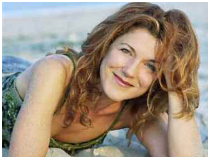
Victoria Clark, Tony Award-winning soprano and actress, to perform Jan. 27 as the Kirk guest artist.