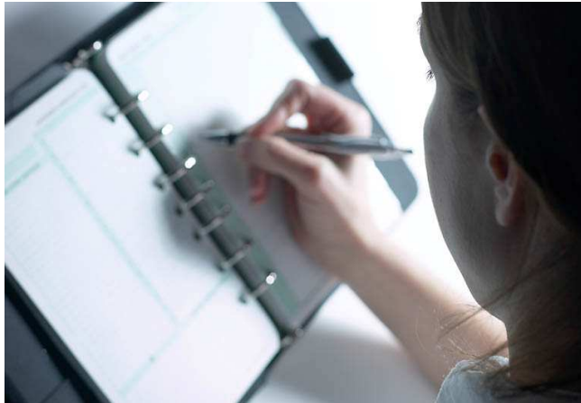
Mark Your Calendar!