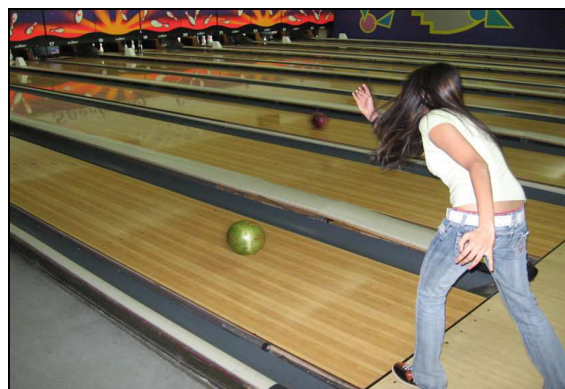
Spring Break Bowling