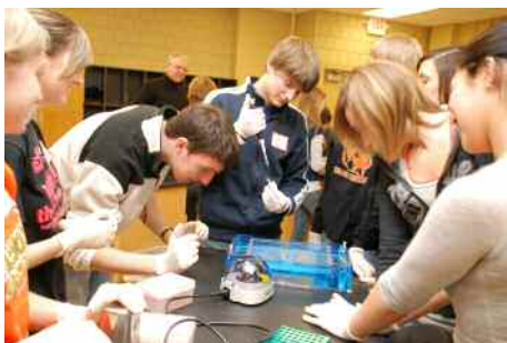
High school students from Van Buren and Arcadia experimented with technology at UF's labs on DNA Day Feb. 20.