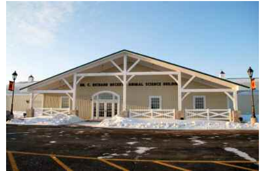
The Dr. C. Richard Beckett Animal Science Building opened on Jan. 26 for classes. The public dedication with tours of the building will be held May 1.