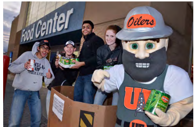
Derrick the Oiler, right, helps UF students collect canned goods at the Walmart on Tiffin Avenue on Nov. 9.