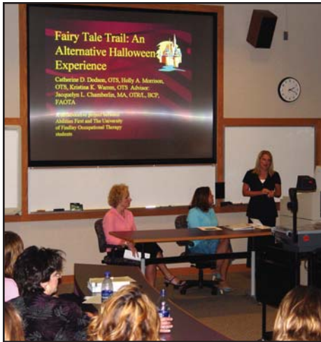
Sixteen students in the occupational therapy program presented their final projects July 14. All of the students were participants in the three-year, weekend master's program.

According to Director and Associate Professor of Occupational