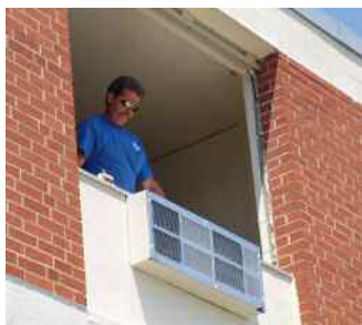
New heating and air conditioning units were installed in each room of Bare and Fox residence halls.

• Many campus improvements were completed this summer. Fox and Bare residence halls received new heating and air conditioning units in each room. To accommodate the new units, each building also has new windows and upgraded electrical systems. With the increased popularity of group houses as a housing option for sophomores and juniors, the University added five houses to its offerings this fall. A total of 24 group houses, which accommodate between four and eight students, will be used this academic year. The UF Village was transformed with a fun new color palette on the walls and floors. Also in the Village, new workspace for student media WLFC 88.3, The Pulse, the Public Relations Student Society of America and the Envoy was created. New sidewalks and colorful landscaping also have enhanced campus this summer.