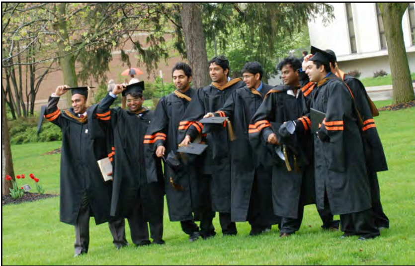
A group of master of business administration graduates gets ready to throw their caps in the air following the Arch Ceremony.