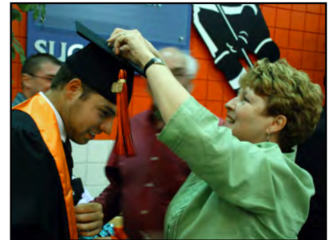
A graduate gets some help from his mom before the processional.