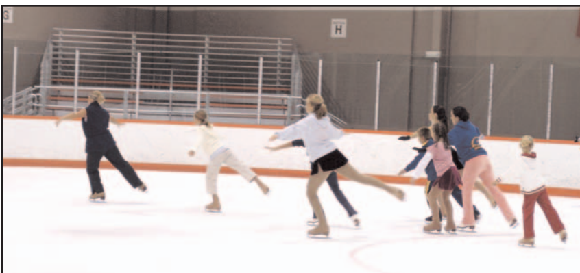
Girls practice their techniques on the ice during the Figure Skating Camp, July 10-15.

FYI is published by the Office of Public Information. Contact Rebecca Shell at x4345 or at shell@findlay.edu to submit information.