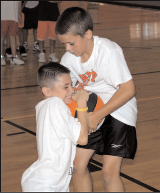
Campers work on their ball-handling skills during the Men's Basketball Day camp, July 11-14.