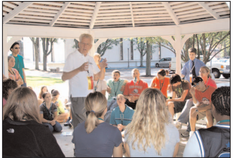
Nearly 145 Ohio high school students learned what it is like to develop and run a company during Ohio Business Week (OBW), July 17-23. This year marked the 11th year OBW has been held on campus.