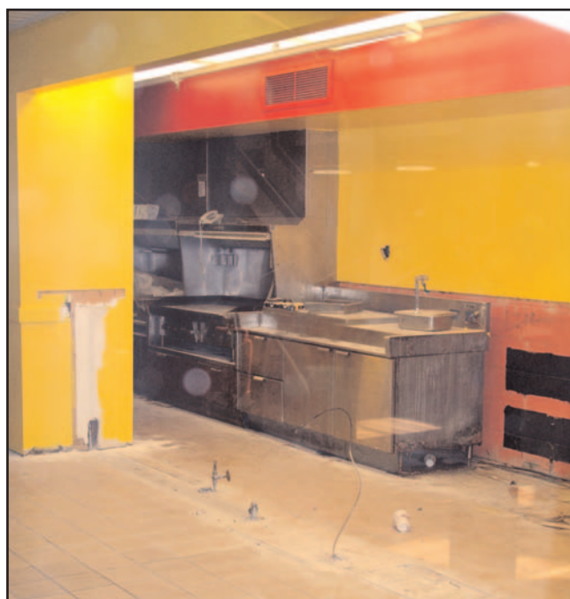
The Cave's service line is being divided into Grill 155, Rappz and Smart Market.

Grill 155, Rappz and Smart Market are slated for completion August 1.