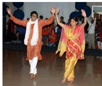
Students from India perform a dance.