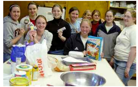
Students baked cookies and distributed them to offices across campus as part of 125 Hours of Service. The project was sponsored by the First-Year Experience peer mentors.