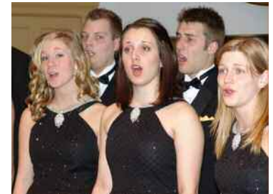
UF Singers in performance.