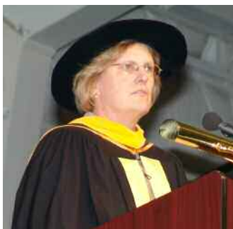
Dr. Kathryn Sullivan