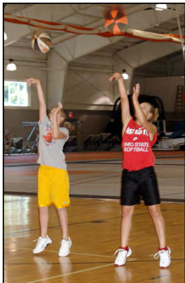
Two young basketball players practice their technique after receiving instruction from the UF basketball summer camp staff.