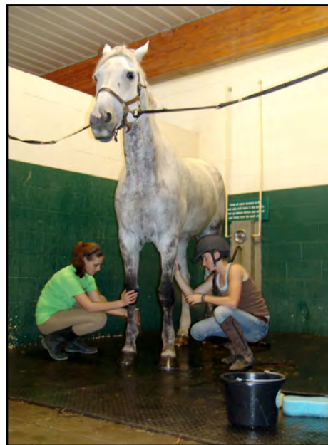
Taking care of a horse is part of the fun during English equestrian summer camp.