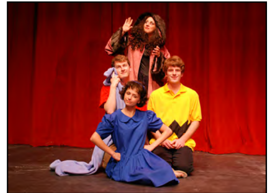
Three cast members from "You're a Good Man, Charlie Brown" (revised) and one cast member from "Into the Woods" pose for a photo. The SummerStock cast and crew began arriving on campus June 11 to prepare for the three shows this season.