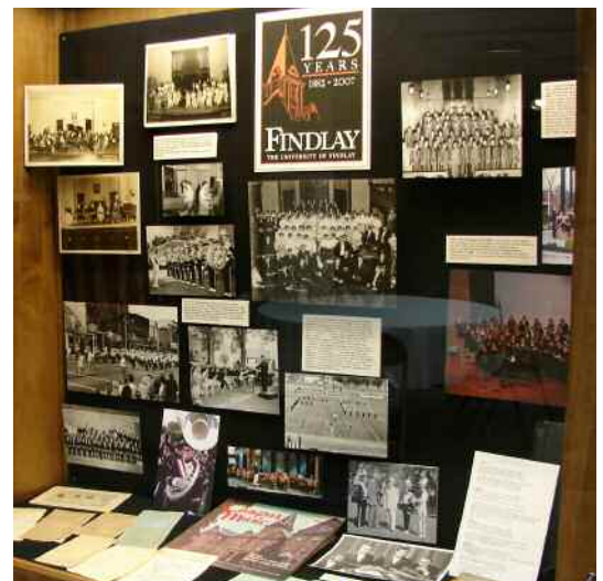
One of the display cases for the current exhibit at the Hancock Historical Museum depicts the music program at UF/FC over the years.