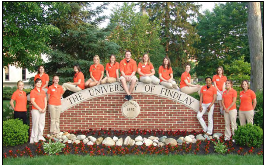
In addition to the admissions staff, current students serve as orientation leaders during New Student Registration Days. Two registration days have been completed, and the next is scheduled for June 13.