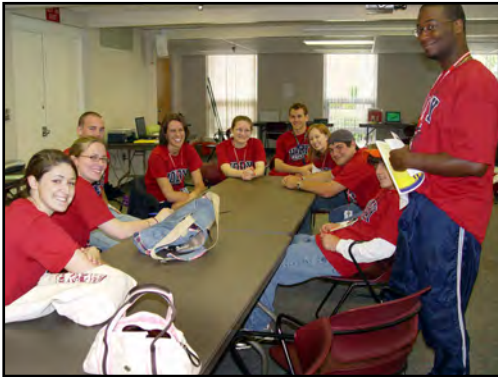
Student leaders at the Hugh O'Brien Youth Leadership conference prepared for a weekend of activity May 17. The group kicked off the summer camp season at the University.

The University of Findlay will host a variety of summer camps this year, bringing nearly 4,000 additional people to campus, and more than 1,800 students will continue their academic studies during summer school sessions.