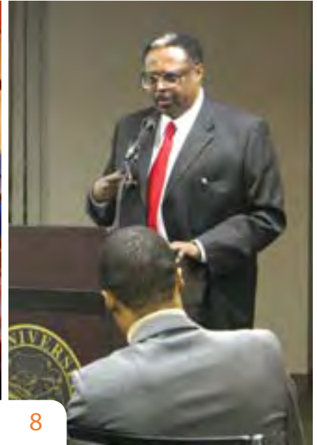
7 - Poster presentations of research projects were a part of the Symposium for Scholarship and Creativity, held April 13. Nearly 140 undergraduate and graduate students gave academic presentations, with more than 340 students recognized for their academic achievements. The event also included alumni guest speakers for each of the six colleges. 8 - Jefferson Thomas, a member of the historic Little Rock Nine, gave a presentation on campus Feb. 2 as a part of Black History Month. He was one of the first black students to integrate Central High School in Little Rock, Ark., as a result of the Supreme Court's 1954 Brown v. Board of Education ruling striking down racial segregation in schools.