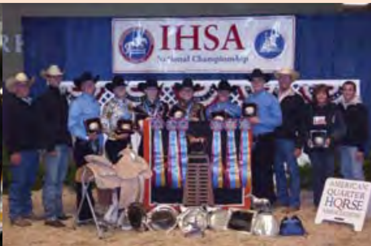
2010 IHSA Western Championship Team