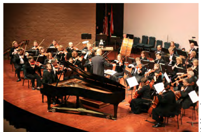
The Toledo Symphony performed on campus Jan. 23. The group will return three times in the coming academic year.

Admission for UF undergraduate and graduate students is free, but a ticket is required. Contact the Box Office at 419-434-5335.