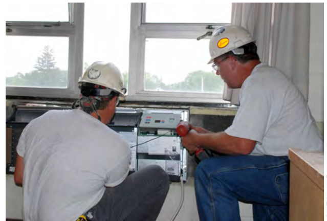
Lovett and Deming residence hall rooms have all received individual heating and cooling units, as shown above.

Both the Davis Street Building and the Brewer Center for the