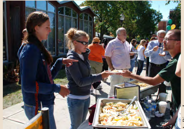
Several students enjoy a sample of food from The Bistro during last year's Market on the Mall event. This year's Market on the Mall is Aug. 25.