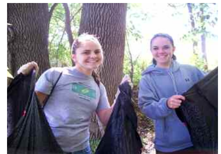
Students helped with the cleanup of the Blanchard River.