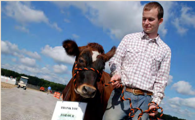
A cow, who resides at the south campus, expresses his gratitude with a sign that reads: "Thank you for our new home!"