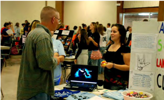
Students learn about the many student organizations on campus.