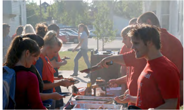
During Greek recruitment, students sample chicken wings served by members of the Greek system.