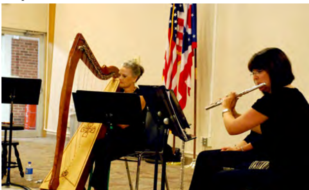
The first Bach's Lunch performance was Sept. 12 with the Harp and Flutes Trio.