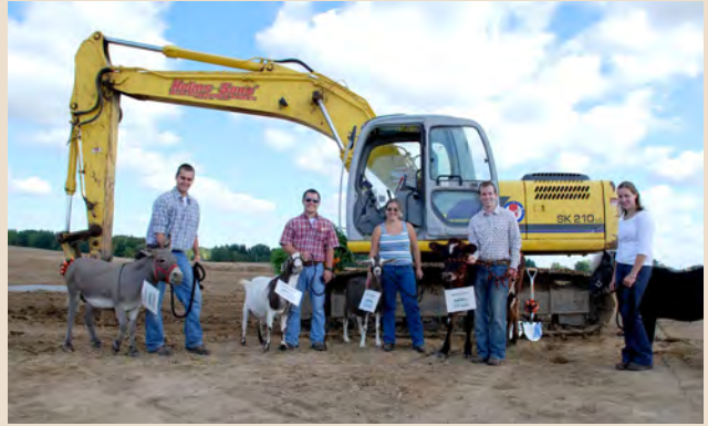
Students give some animals a tour of the new building site.