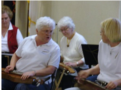
Dueling dulcimers was one fun feature of The Dulcimer Gathering!