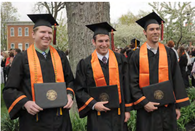
Several new graduates pose for a photo on the front lawn following the Arch Ceremony.