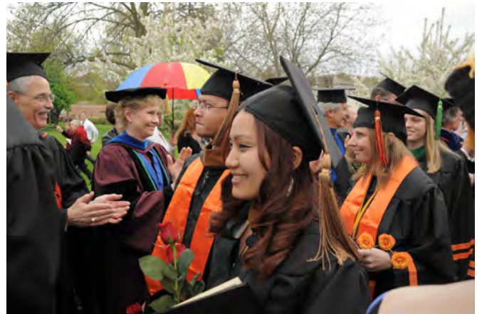
New graduates walk through the Griffith Memorial Arch as faculty members applaud their achievements.