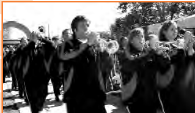
The UF Oiler Brass and alumni marching band kicked off the golf cart parade by leading them down Main Street and onto the campus through the Griffith Memorial Arch.