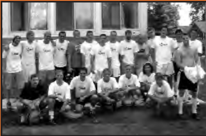
A reunion for men's and women's soccer alumni was held Aug. 20 at DeHaven Field. Staff from the Office of Alumni & Parent Relations cooked hot dogs and hamburgers for the alumni, current students and parents attending.