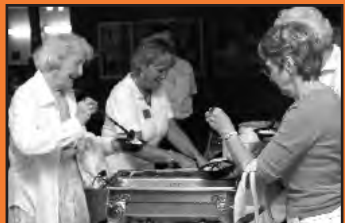
The annual ice cream social sponsored by the Alumni Association Board of Governors was held July 26 prior to the opening of the SummerStock presentation of "Beauty and the Beast." More than 100 alumni and friends of the University enjoyed Dietsch's ice cream and socializing.