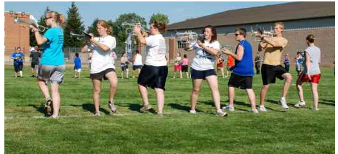
A record 72 members of the Oiler Brass marching band prepared for a new season of performances during three-a-day practices prior to the beginning of fall semester.