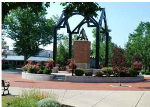
Campus was never more beautiful in summer with an array of baskets and planters overflowing with flowers.

Thousands of annuals, 16 hanging baskets, 25 pedestal baskets, 22 concrete planters and a dedicated physical plant staff make for one beautiful campus. Geraniums, wave petunias, marigolds, impatiens, vines, shrubs, trees and grass have been cared for daily by five staff members and their summer student helpers on the main campus. They're responsible for mowing, weeding, trimming, watering and dead-heading flowers – there are 500 geraniums around the flagpole alone. Caring for the grounds is the end result of good planning this spring. In January, UF staff members attended a trade show in Columbus and came back with some great ideas, such as hanging flower baskets from campus lampposts. More color was added to several areas of campus, but Old Main remains the focal point. All landscaping decisions on campus are made with the original architecture of the buildings in mind, and a University handbook is available to aid in those decisions. "I've seen people walk around and admire the landscaping during orientation and registration days," said Keith Samsal, groundskeeper. "We're beautifying campus, and it's appreciated." With help from Stratton Greenhouse staff, who put together the planters and baskets, next spring promises to be just as colorful. To see more, click here .