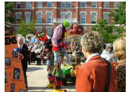
You won't want to miss the golf cart parade and celebration on the front lawn of Old Main for Homecoming!

Saturday’s activities begin with the 5K and Little Oiler Fun Run, the annual Alumni Association breakfast and the Athletic Hall of Fame ceremony. Bring the kids for the front lawn celebration with a golf cart parade, KidsZone, pony rides, UF Oiler Express train ride, face painting, magic tricks and more. Immediately following will be the alumni tailgate party at Donnell Stadium. Be prepared to cheer the Oilers to victory against the Wayne State Warriors. Come dressed in orange and black and watch for judges voting on the alumna/alumnus and student displaying the most UF spirit. It’s your chance to win a $50 gift certificate to the UF Oiler Mart! Sign up today and keep the traditions and spirit of your alma mater alive. For a complete list of UF Homecoming events visit www.findlay.edu , KEYWORD: Homecoming.