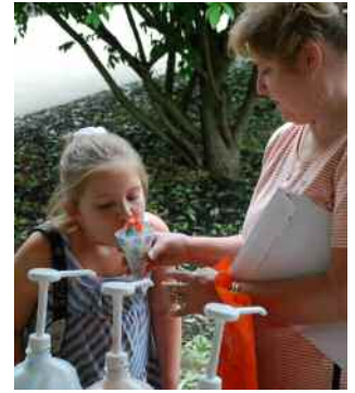
Snow cones were a welcome treat for families during move-in day.