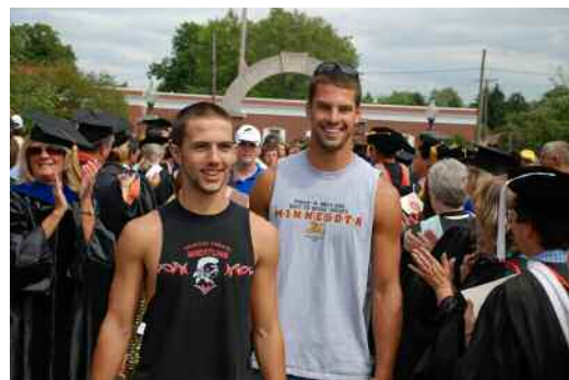
Faculty greeted more than 700 new students who marched through the Griffith Memorial Arch as part of the traditional ceremony on Aug. 24.