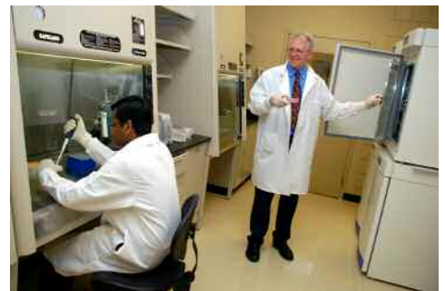
The University of Findlay created five new labs in the Davis Street Building, investing approximately $400,000 in each lab.