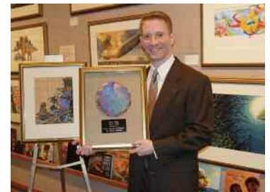
Robert Sabuda, who received a Mazza Medallion for his artwork in 2004, will be a guest speaker, along with Matthew Reinhart, at the 25th Mazza Celebration Sept. 30 at 2 p.m. in the AMU.

• The Mazza Museum of International Art from Picture Books will host its 25th Mazza Celebration featuring Robert Sabuda and Matthew Reinhart , creators of the "most amazing pop-up books ever!" The presentation will be held at 2 p.m. Sunday, Sept. 30, in the Alumni Memorial Union. Admission is $5. To register, send your name, address, city, state, ZIP, phone number and the number of tickets needed, as well as a check in the amount of $5 per person, to the Mazza Museum, The University of Findlay, 1000 N. Main St., Findlay, OH 45840. For more details, call 419-434-4560.