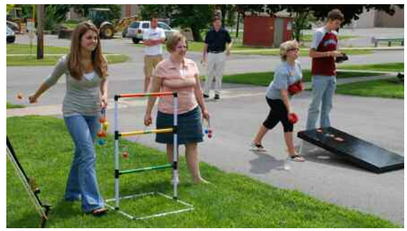
The Findlay Summer Send-off at the Stout Alumni Center Aug. 18 included games for all.