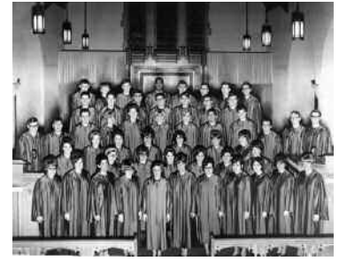
Findlay College choir c. 1967