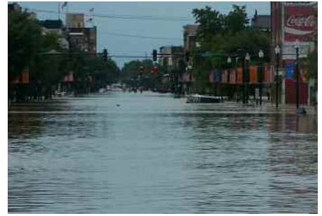
Findlay's downtown on Aug. 22, 2007