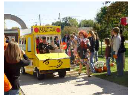
The Mazza bus drew smiles at last year's Homecoming golf cart parade.

Less than a month away, we will be celebrating Homecoming 2007- Celebrating the Past, Embracing the Future! I would like to invite you to come home to your alma mater October 12 – 14 to reunite and commemorate this special occasion. Many exciting events are being planned for you and your classmates to have a memorable Oiler experience. Saturday, Oct. 13 there will be something for everyone. The front lawn celebration includes the golf cart parade led by the marching band and Oiler Brass alumni, followed by the FC/UF choir alumni mini-concert, class reunions, KidsZone, inflatables, Create-a Cookie contest and much more (see details listed below).