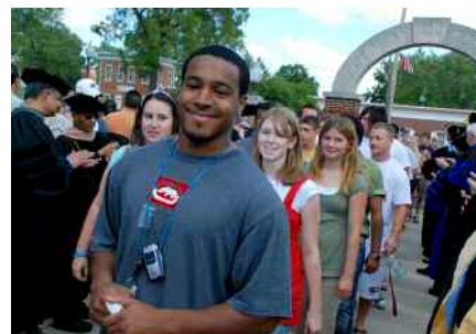
Freshmen from the Class of 2011 marched through the Griffith Memorial Arch on Aug. 26.