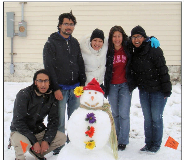
Previous students build a snow man