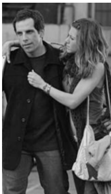
Ben and Jennifer draw fans.

This movie is pretty dull. Unless you are a Ben Stiller or Jennifer Aniston fan, save your money and wait for it to come out on video.