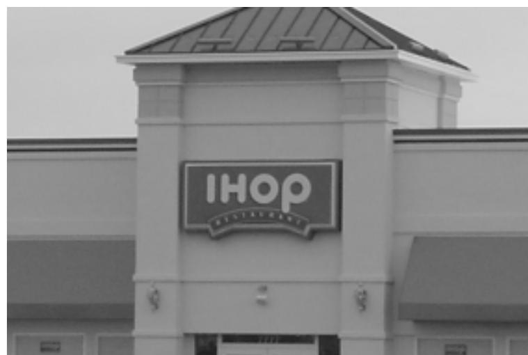
IHOP serves pancakes and more all day long.

I ordered the International Passport Breakfast. It included two eggs, two strips of bacon, two sausage links and two pancakes. I chose the French crepe-