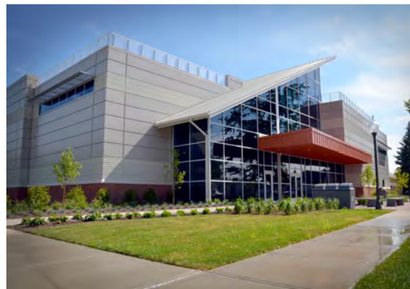
The new addition to the Davis Street Building is open for fall classes with science laboratories, classrooms, a lecture theater, a computer lab and more.

Sciences, Health Professions and Pharmacy. It is the first new construction incorporating extensive green technologies at The University of Findlay. The addition has a geothermal heating and cooling system, which will take only 5.6 years to pay for itself in energy savings. The building is highly insulated and uses computerized sensors to adjust the amount of required lighting. The laboratories are equipped with sophisticated fume hoods that sense both human movement and the presence of chemicals, so that the hoods run when necessary, but drop to low power or shut off to save energy when not needed. The building also has an air handling system that maintains a level of 10 percent fresh air at all times. An underground system of piping is in place to control rainwater runoff from the building, designed to handle runoff from a 100-year rain.