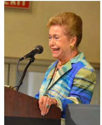
Best-selling mystery writer and children's book author Mary Higgins Clark head-lined the Mazza Summer Conference.