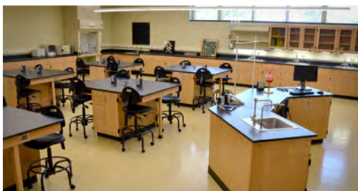
This is one of many state-of-the-art laboratories used for biology-based science courses.

The new two-story, 42,000-square-foot addition to the Davis Street Building is ready for students when they return for classes on Aug. 20. The $11 million addition contains 19 science laboratories, four classrooms, a 105-seat lecture hall, a computer lab, 15 faculty offices, a conference room and a student lounge. It primarily houses the biology program and related forensic science laboratories. Growth in enrollment in science-based degrees created an urgent need for new facilities. More than 2,000 students are enrolled in the Colleges of