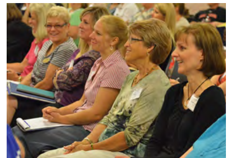
Mazza Enthusiasts joined teachers and librarians in enjoying the conference.

with special pull-out sessions that addressed topics such as incorporating biographies in the classroom, instructions for art projects, reviews of outstanding new children's books, how to use storytelling to interest students in reading, how to introduce children to writing, how to foster the hesitant reader and a special writing strand for aspiring authors. More than 270 people attended the conference from 21 states representing New Hampshire, Connecticut, New Jersey, Virginia, Florida, Tennessee, Texas, Colorado, Wisconsin, California, Oregon, Washington and others. The conference also could be taken for undergraduate or graduate credit. The Mazza Museum will host its 15th annual Fall Weekend Conference Nov. 9-10, 2012, featuring Mo Willems, New York Times best-selling author and illustrator and a Caldecott Honor award winner, along with Philip and Erin Stead, David Ezra Stein, Gary Schmidt and Jon Muth. David Macaulay will be awarded the biennial Mazza Medallion for artistic diversity of media in illustration. Space is limited. To register, click here . The Mazza Museum is celebrating its 30th anniversary during 2012.