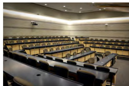
The 105-seat lecture theater is one of the largest classroom spaces on campus and is equipped with the latest in teaching and learning technology.

Health Professions and Pharmacy. It is the first new construction incorporating extensive green technologies at The University of Findlay. The addition has a geothermal heating and cooling system, which will take only 5.6 years to pay for itself in energy savings. The building is highly insulated