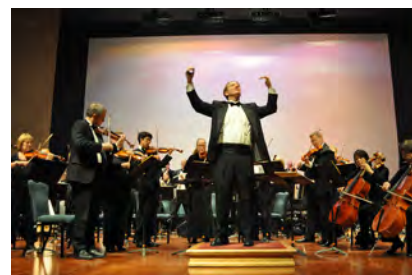
The Toledo Symphony Orchestra, conducted by Jeffrey Pollock

Admission for UF undergraduate and graduate students is free, but a ticket is required. UF faculty and staff may purchase tickets for $15. Tickets are available by calling the Box Office at 419-434-5335 or emailing boxoffice@findlay.edu .