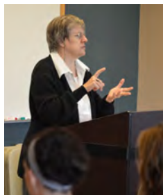
Kathleen Norris, best-selling author and poet, spoke to students during a master class on creative writing.