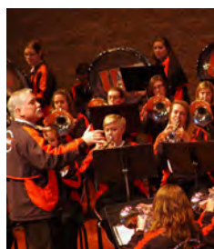
The Oiler Brass