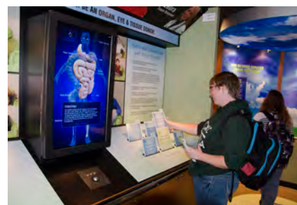
Students learned about organ and tissue donation through displays and materials available in the truck.

to the campus to tour. About 1,150 brochures and pens were distributed to students, faculty and staff.