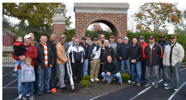
The 1997 football team held a 15-year reunion on Oct. 6, 2012, celebrating its NAIA national championship. An open house in the Gardner Fitness Center football offices was held prior to the game at Donnell Stadium. A reception was held after the game at the Findlay Inn and Conference Center.