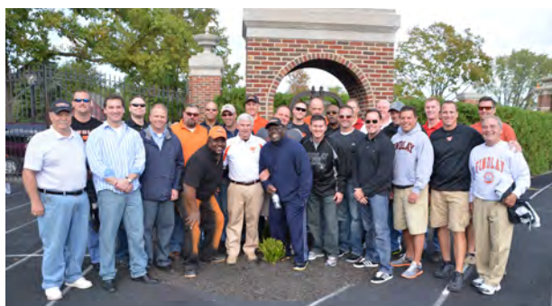
The 1992 football team gathered for a reunion on Sept. 29, 2012, to celebrate the 20th anniversary of its NAIA national championship win. The day included open hours in the football offices in Gardner Fitness Center in the morning, followed by the game at Donnell Stadium and an evening reception at the Findlay Inn and Conference Center.

For more information or to register, call The Center for Alumni, Parents & Friends at 419-434-4516 or www.findlay.edu , KEYWORD: Kalahari.