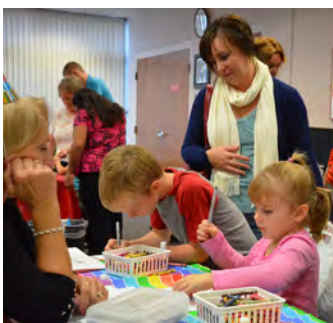
Youngsters and their families enjoyed the many activities offered at Funday Sunday.

The Mazza Museum hosted a 30th birthday party during Homecoming weekend as part of its Funday Sunday activities on Oct. 14, with more than 350 people in attendance.