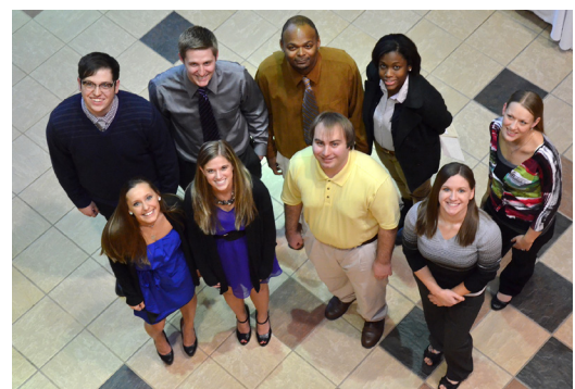
Nine graduates of the Nuclear Medicine Institute were recognized at a ceremony held Jan. 11, which was sponsored by the Center for Alumni, Parents and Friends, and the Diagnostic Services Department at UF.