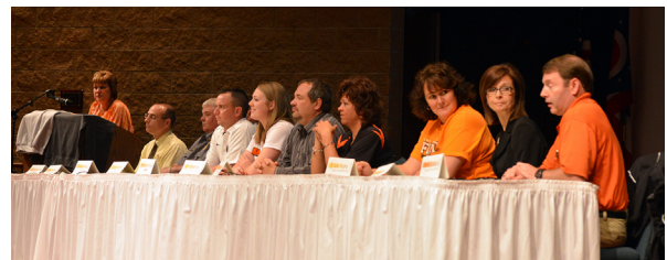
A panel of campus experts answered parents' questions during New Student Registration Days.

The campus gave a warm welcome to new students and parents on May 15 and 23 and June 5 for New Student Registration Days. Part of each day included a parent panel from the Wolfe Center for Alumni, Parents and Friends. The panel discussion allows parents to ask questions