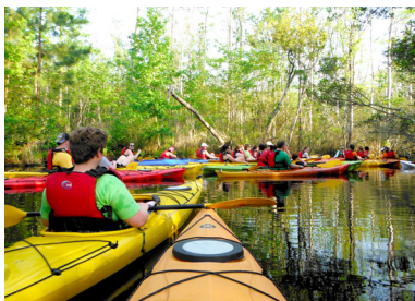
Wilderness Club members kayaked during a summer learning experience in the Outer Banks.