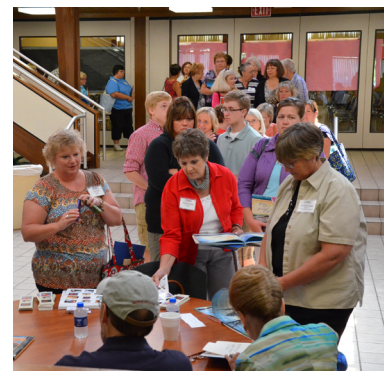
Mazza Summer Conference attendees have the opportunity to have their books signed by the guest authors and illustrators.

Children's book lovers will convene at the Mazza Museum for its 20th annual summer conference held July 15-19 to learn from award-winning authors and illustrators. This year, conference attendees – which generally include teachers, librarians, docents, students and others – will rub elbows with keynote speakers such as Jon Klassen. Klassen, who won a Caldecott Medal and a Caldecott Honor in 2013, is the first person to win both awards in the same year. Klassen illustrated “Cats’ Night Out” and wrote and illustrated “I Want My Hat Back,” among others. The conference will include keynote speakers, as well as pullout sessions. Click here for more info.