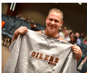
Parents will have a chance to win a UF sweatshirt at Homecoming/Family Weekend.

on topics ranging from life in a dorm, laundry and study habits, campus involvement, health services, technology, and the safety and resources available on campus and in the city of Findlay. Also, parents register for the parent email distribution list to receive the monthly parent newsletter, "Inside the Arch." (To sign up, click here .) Parents and families are invited to campus for Homecoming and Family Weekend, and parents have the opportunity to win a UF mom or dad sweatshirt.