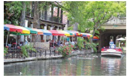
Along the San Antonio River Walk