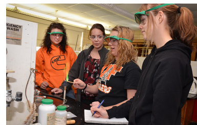
Students in the post-secondary options/dual enrollment program with The University of Findlay.