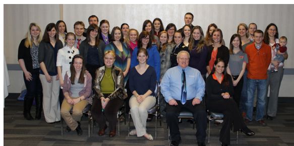
Annual pre-vet reception in Columbus on Feb. 23.