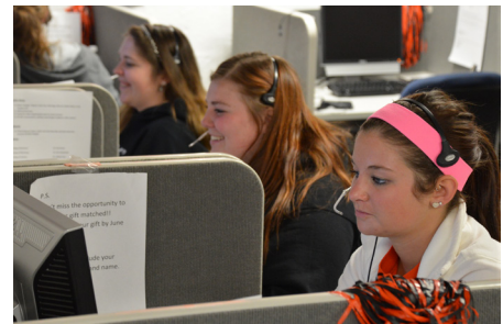
Members of the UF Student Development Officers enjoy talking to alumni and hearing about their Findlay memories.

Click here to view the Facebook page. The students enjoy connecting with alumni, and they hope you will continue to support them by taking time to talk about the great memories you had as a student and/or how you are doing today. Three seniors will be recognized on March 26 for meeting all requirements for the UF Philanthropy Certificate.