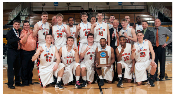
Men's basketball GLIAC champions!