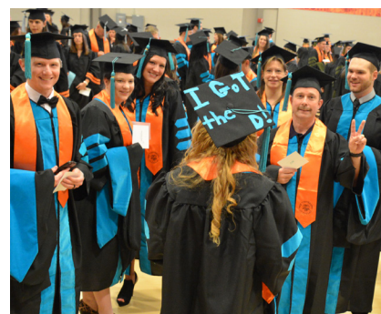
Candidates for the doctor of physical therapy line up prior to the march.