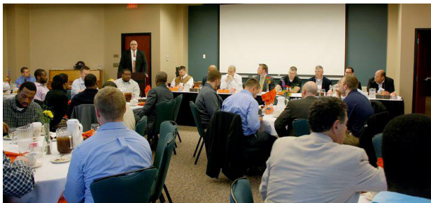
Junior and senior football players gathered for a networking dinner with football alumni.