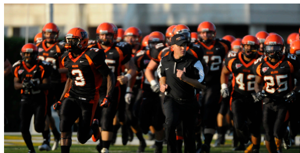
The Oilers football team will play a nationally televised game during the fall 2013 season.