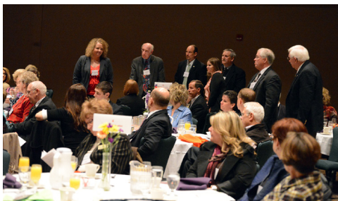
Among the many volunteers recognized at the Volunteer Advisory Board Summit were those who serve on the advisory board for the College of Pharmacy.