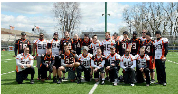
Alumni football players returned for the all-teams Findlay football reunion.