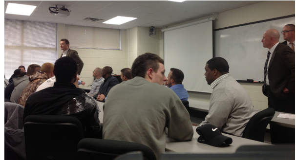
Alumni football players met for a mentoring session with the freshman and sophomore football players.