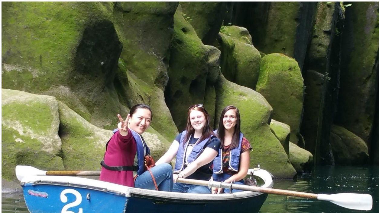
Rowing in Takachiho Gorge, Miyazaki, Japan