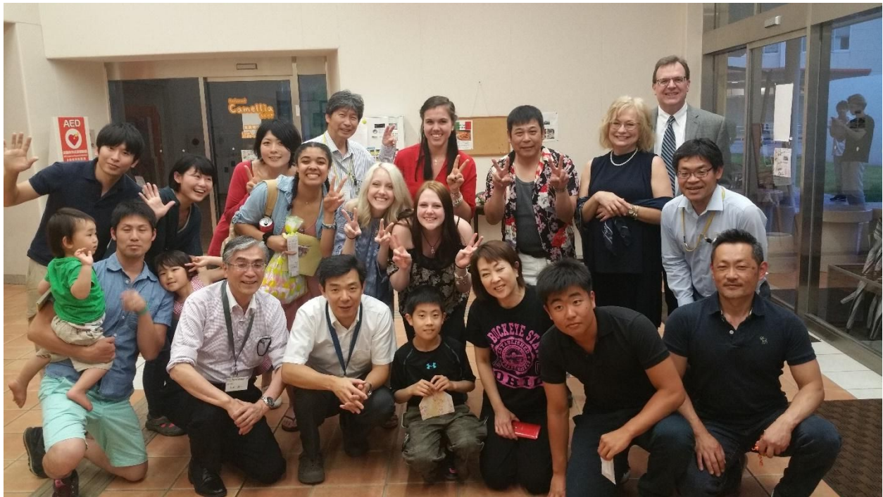
Farewell Group Picture

Some KUHW and University of Findlay Faculty, Students and Host Families