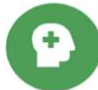
Mental Health Screenings