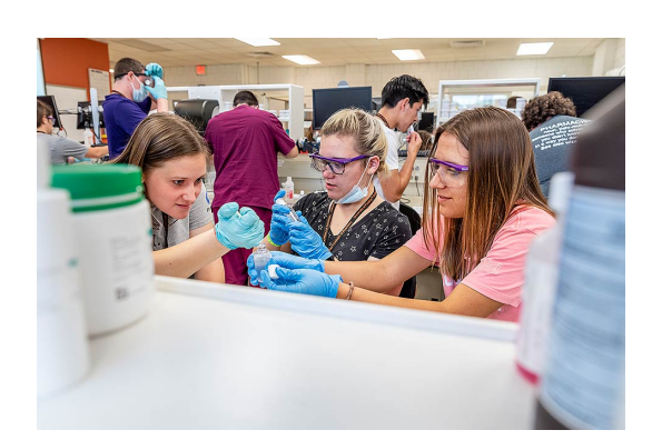
Budding Pharmacists get a Dose of the Profession

September 19th-Rho Chi Induction Ceremony September 19th-Career Fair REGISTRATION INFORMATION September 27th-29 Homecoming Weekend October 7th & 8th-UF Fall Break