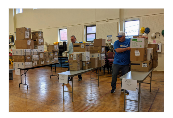
Coming Together: University of Findlay

Click <u>HERE</u> to check out the video from 13ABC News!